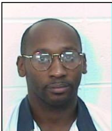
Photo of Troy Davis